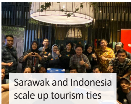
Sarawak and Indonesia scale up tourism ties