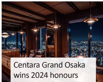
Centara Grand Osaka wins 2024 honours