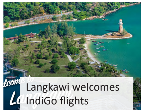
Langkawi welcomes IndiGo flights