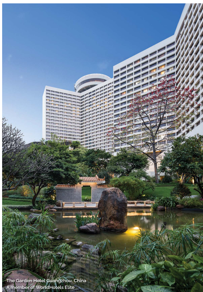
The Garden Hotel Guangzhou, China A member of WorldHotels Elite

Welcome to WorldHotels. Welcome to a World of Your Own.