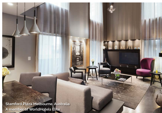
Stamford Plaza Melbourne, Australia A member of WorldHotels Elite

A World where craftsmanship is celebrated, details are thoughtfully considered, and experiences are immersive. Where luxury blends seamlessly with authenticity, and the world outside inspires the one within. Never just a place to pass through, this is a place to truly connect with the soul of a city, the culture of a region and the wonders of nature. Discover a World of Difference™ at WorldHotels.