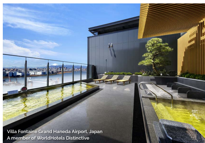
Villa Fontaine Grand Haneda Airport, Japan A member of WorldHotels Distinctive